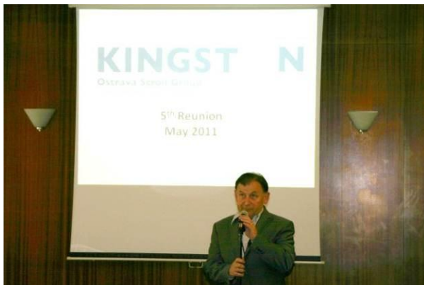
The Ambassador, Michael Žantovský, welcoming us to the Embassy

On 15 th May about 70 of us met in the Czech Embassy in Kensington, where we were welcomed by the Ambassador, His Excellency Mr Michael Žantovský.