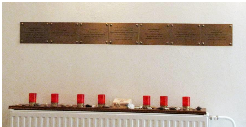
Plaques in the Ohel