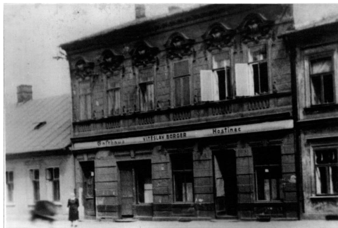
The Borger Tavern

Do you know the Borger family or the Tavern?